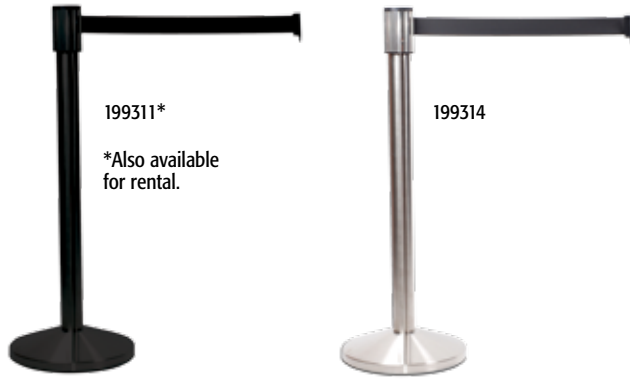
199311* *Also available for rental.