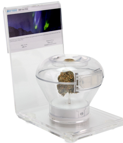
133010 Clear Acrylic Holder