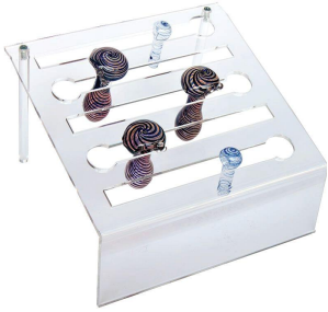
165019 Pipe Rack Stand