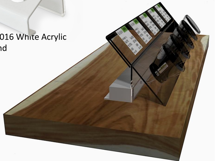
133016 White Acrylic Stand