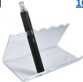
165016 Vape Acrylic Display Stand