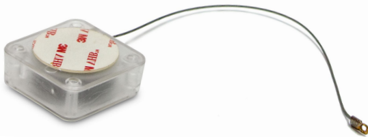
133015 Security Tether