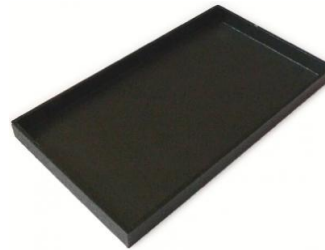
163200 Black Tray For c163340