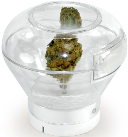
133000 Aroma Orb™