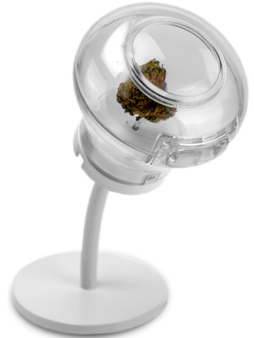
133012 metal stand