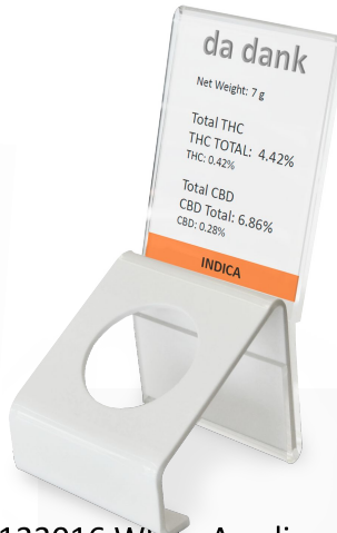
133017 Clear Acrylic Signholder